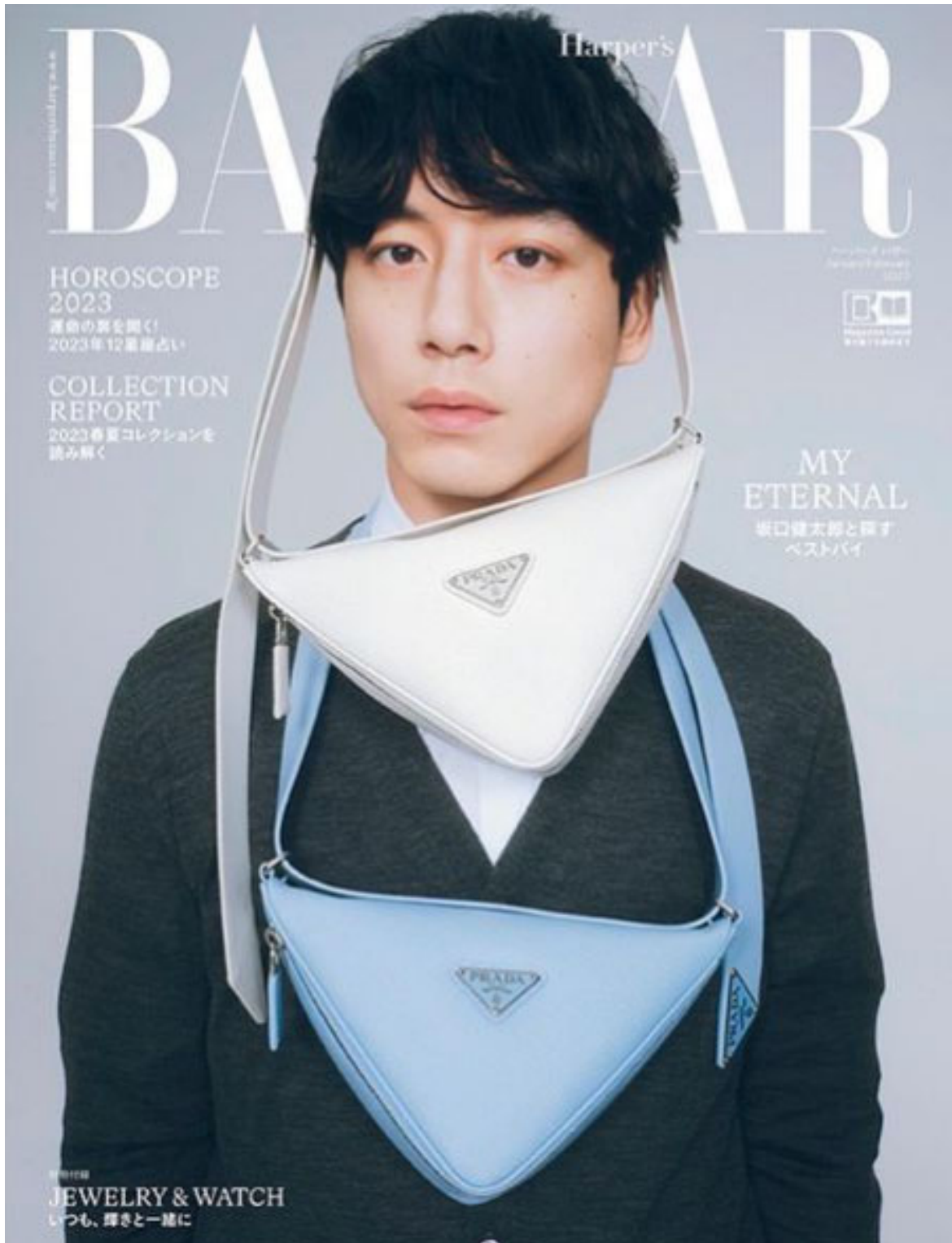
GIAPPONE - HARPER'S BAZAAR - PRADA UOMO COVER - 01.12.22