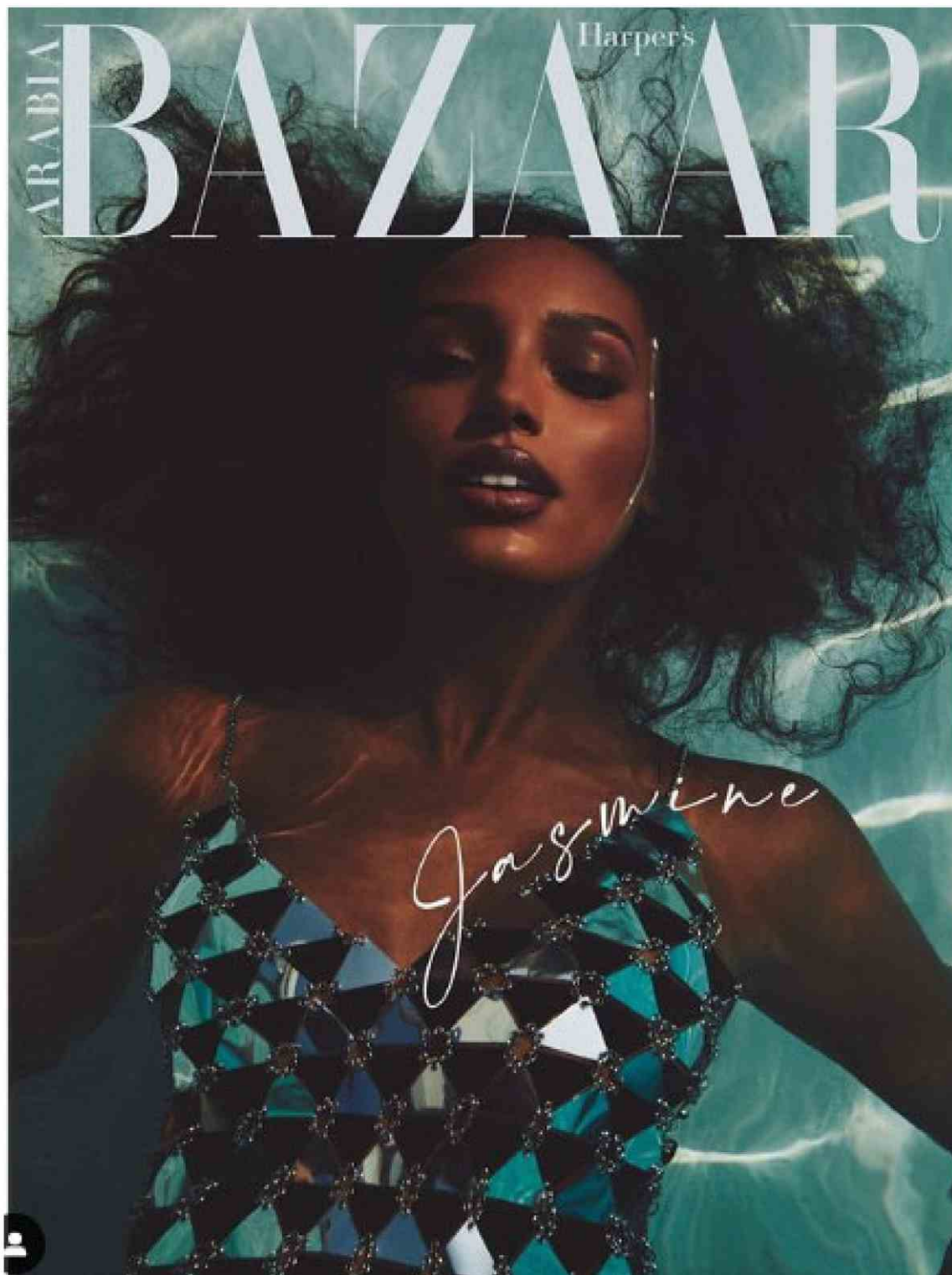
QATAR - HARPER'S BAZAAR - PRADA COVER - 01.12.22